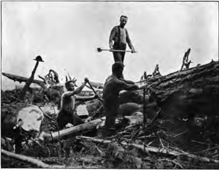
HANDLOGGERS COAXING A LOG : ROLLING IT OVER WITH SCREWS AND BARKING IT.