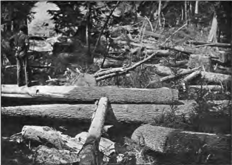
WHERE HANDLOGGERS ONCE WORKED.