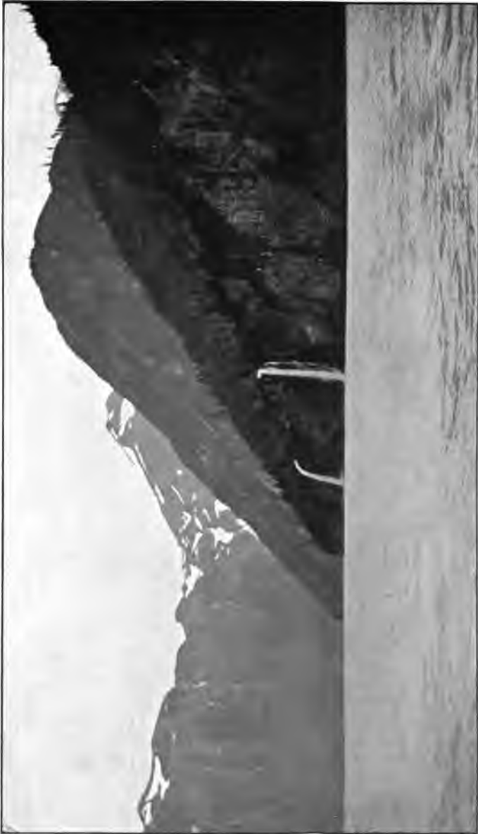
ON COOK INLET.