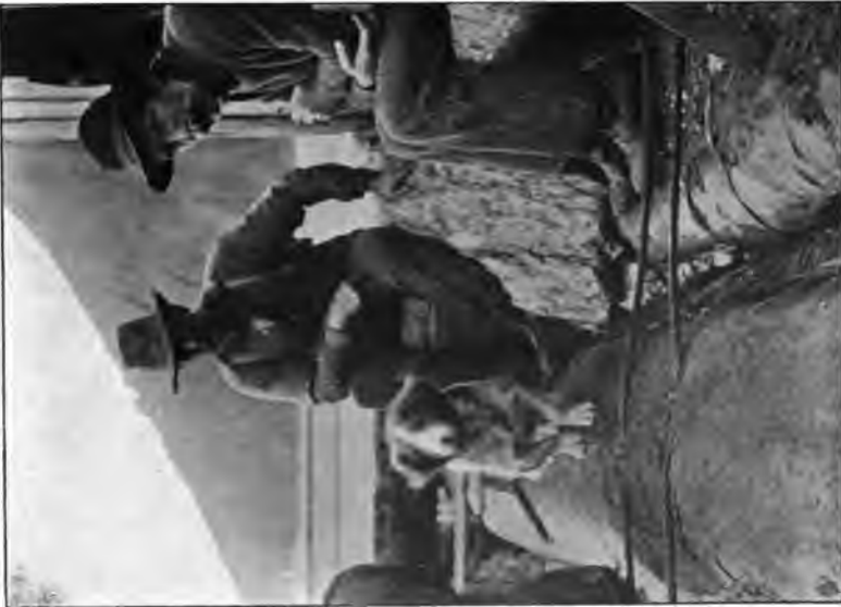
IN THE EVENING.