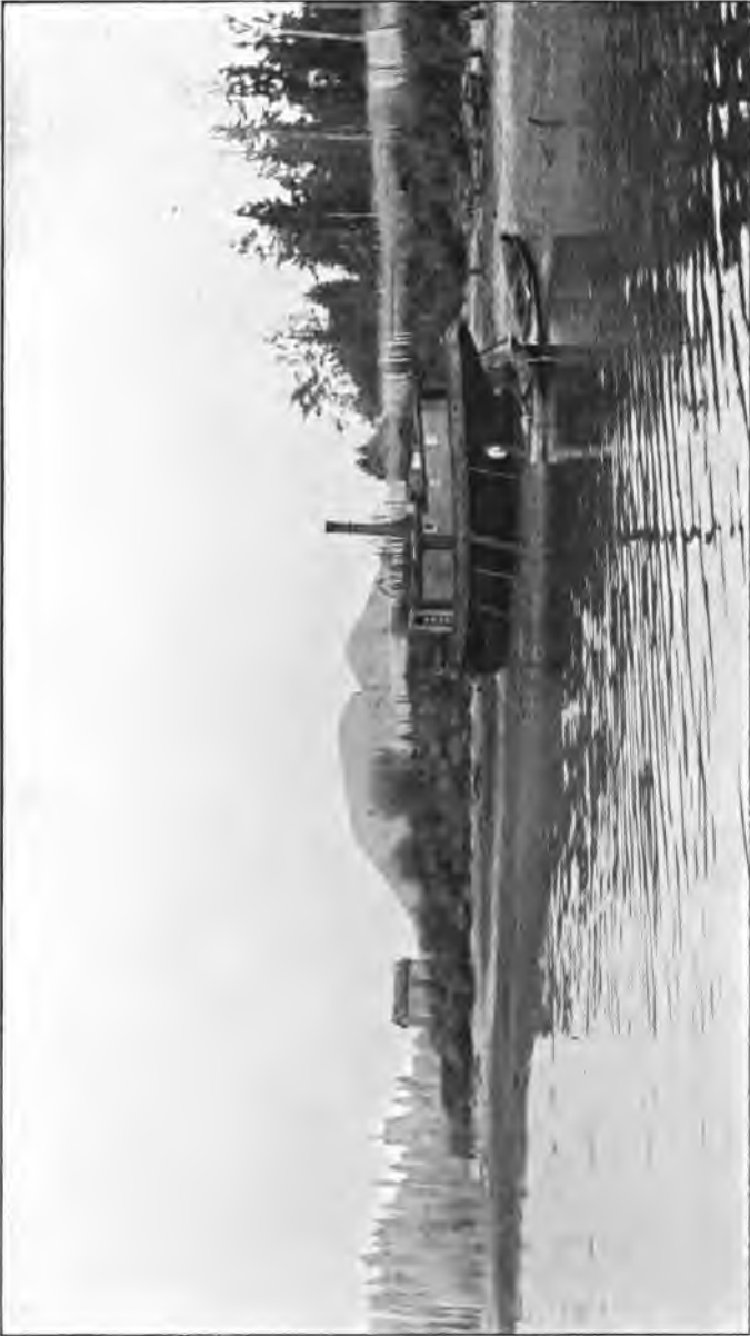
THE SAVORA AFTER AN ACCIDENT.