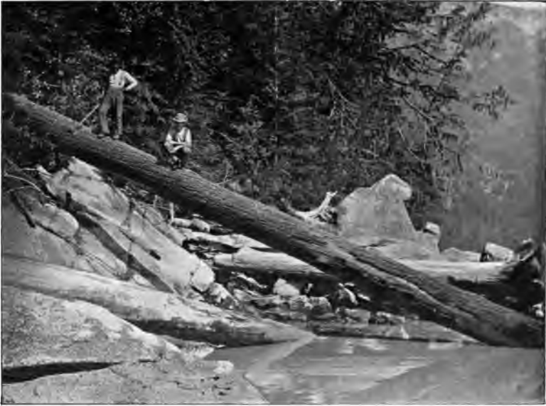
A LOG SHOT DOWN THE MOUNTAIN SIDE BY HANDLOGGERS.