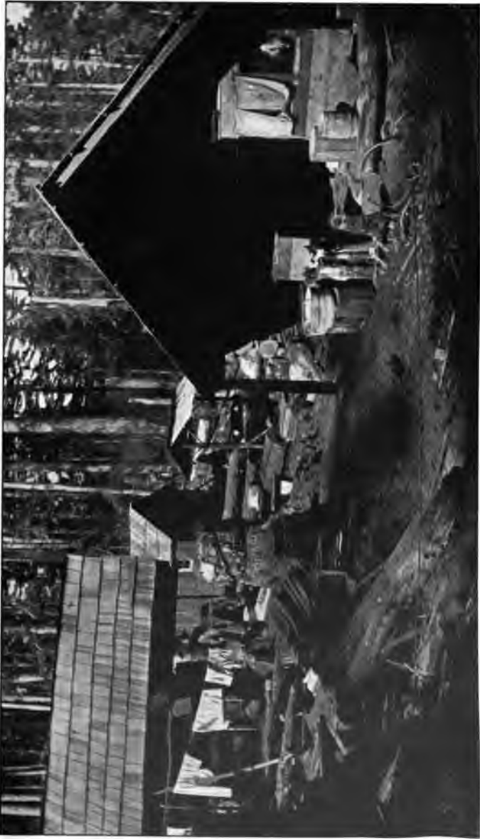
“THERE'S WORSE PLACES THAN A LOGGING CAMP.”